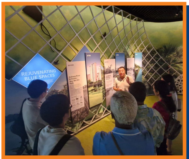
Here's our expert guide in white!