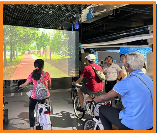
Biking to play the video