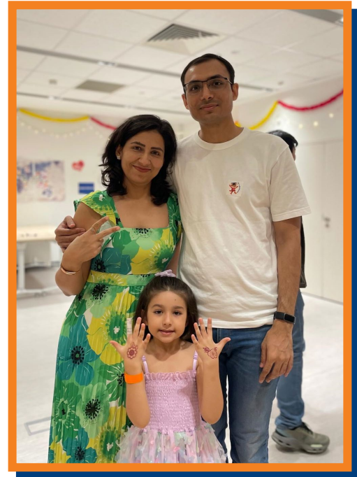
Beautiful henna tattoos and even more beautiful smiley faces!