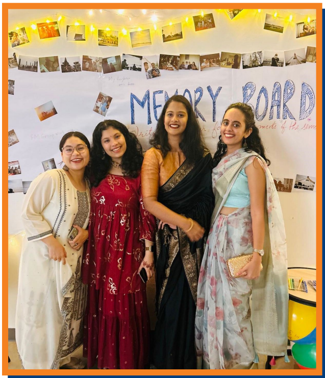
Lighting up the festival of lights with love and cherished memories of the semester at the memory board!