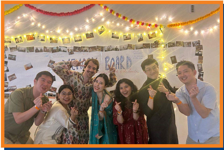
CSC Club core members slaying the festive vibes in stunning Indian costumes!