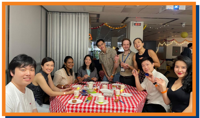
MBA's getting creative and colorful with the diya painting activity!

Thank you, CSC Club, for organizing such an incredible Dipavali celebration! It was a joy for Indians and international friends alike to experience the festival of lights together. ✨ P.S. The dance party after dinner was unforgettable, though sadly, we can't share the videos here.